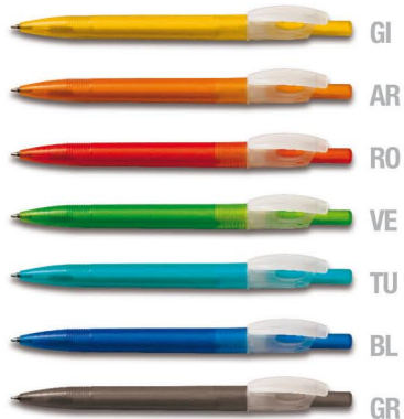
SERIE A05 TS